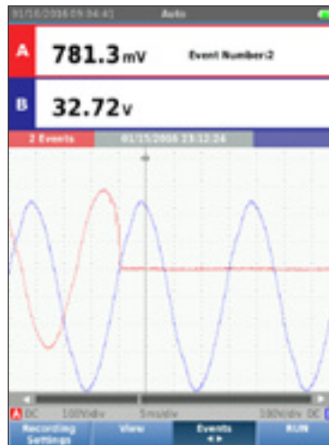
Quickly step through recorded events to identify and troubleshoot intermittent faults.