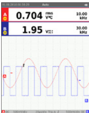
Fluke Connect-and-View™ triggering with Auto Reading function using Fluke IntellaSet™ technology gives you quick access to the data you need.

*Not all models are available in all countries. Check with your local Fluke representative.