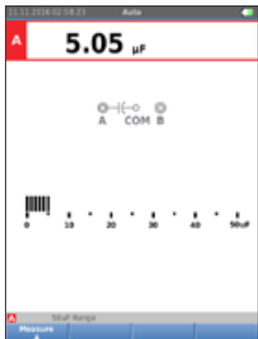
A single test tool measures volts, ohms, amps or capacitance, in addition to displaying waveforms.

Harmonics are periodic distortions of voltage, current, or power sine waves. Harmonics in power distribution systems are often caused by non-linear loads such as switched mode dc power supplies and adjustable speed motor drives. Harmonics can cause transformers, conductors, and motors to overheat. In the Harmonics function, the Test Tool measures harmonics to the 51st. Related data such as dc components, THD (Total Harmonic Distortion), and K factor are measured to provide a complete insight in to the electrical state of health of your loads.