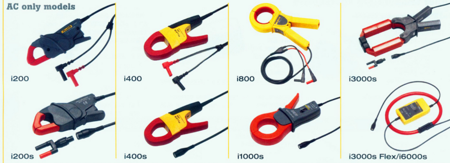
i3000s Flex-24 (24 dia), i3000s Flex-36 (36 dia), i6000s Flex-24 (24 dia) i6000s Flex-36 (36 dia)