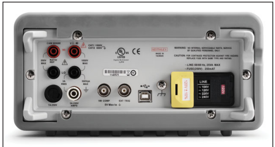
Model 2100 rear panel

AC CMRR: 70dB (for 1kΩ unbalance LO lead). POWER SUPPLY: 120V/220V/240V. POWER LINE FREQUENCY: 50/60Hz auto detected. POWER CONSUMPTION: 25VA max. DIGITAL I/O INTERFACE: USB-compatible Type B connection. ENVIRONMENT: For indoor use only. OPERATING TEMPERATURE: 5° to 40°C. OPERATING HUMIDITY: Maximum relative humidity 80% for temperature up to 31°C, decreasing linearly to 50% relative humidity at 40°C. STORAGE TEMPERATURE: -25° to 65°C. OPERATING ALTITUDE: Up to 2000m above sea level. BENCH DIMENSIONS (with handles and feet): 112mm high × 256mm wide × 375mm deep (4.4 in. × 10.1 in. × 14.75 in.). WEIGHT: 4.1kg (9 lbs.). SAFETY: Conforms to European Union Directive 73/23/ECC, EN61010-1, UL61010-1:2004. EMC: Conforms to European Union Directive 89/336/EEC, EN61326-1. WARRANTY: One year.