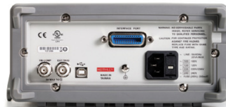
Model 2110 rear panel.

INPUT BIAS CURRENT: <30pA at 25°C. INPUT PROTECTION: 1000V all ranges (2W input). AC CMRR: 70dB (for 1kΩ unbalance LO lead). POWER SUPPLY: 100V/120V/220V/240V. POWER LINE FREQUENCY: 50/60Hz auto detected. POWER CONSUMPTION: 25VA max. DIGITAL I/O INTERFACE: USB-compatible Type B connection, GPIB (option). ENVIRONMENT: For indoor use only. OPERATING TEMPERATURE: 0° to 40°C. OPERATING HUMIDITY: Maximum relative humidity 80% for temperature up to 31°C. STORAGE TEMPERATURE: -40° to 70°C. OPERATING ALTITUDE UP TO 2000 M ABOVE SEA LEVEL. BENCH DIMENSIONS (WITH HANDLES AND BUMPERS): 107 mm high × 252.8 mm wide × 305 mm deep (3.49 in. × 9.95 in. × 12.00 in.). WEIGHT: 2.23 kg ( 4.92 lbs.). SAFETY: Conforms to European Union Low Voltage Directive, EN61010-1. Measurement Cat 1 1000V and CAT II 600V. EMC: Conforms to European Union Directive 89/336/EEC, EN61326-1. WARRANTY: One year.