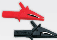
BP-276N (Alligator Clip, UL 1KV CAT II, 10A)