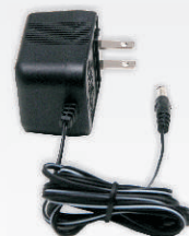
Adapter ADP-110 or ADP-220 DC 9V/300mA