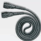
BP-250 (BNC Plug to BNC Plug, 50Ω cable 100cm)