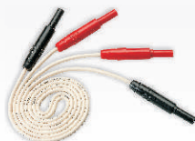
BP-366 (HV Banana Plug to Banana Plug, UL3239, 16AWG., 20KV DC, 10A, 150°C, 60cm, silicone wire)