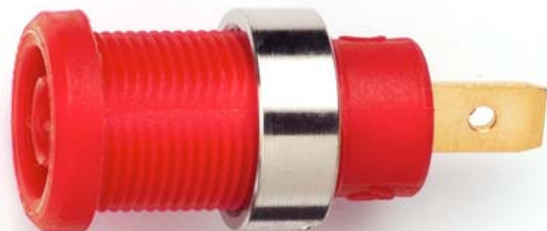
Model 72913 Panel Mount IEC61010 4mm (0.16in) Jack for Sheathed Banana Plugs

Panel Mt IEC61010 4mm (0.16in) Jack for Sheathed Banana Plugs