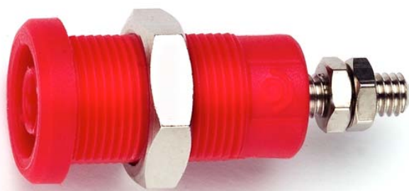
Model 72930 Panel Mount IEC 61010 4mm (0.16in) Jack for Sheathed Plugs