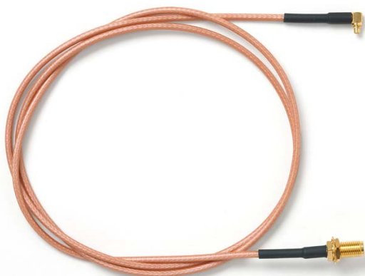
Model 73066 MMCX Right-Angle Plug to SMA Bulkhead Jack, RG316/U

Small size, and durability for confident connections