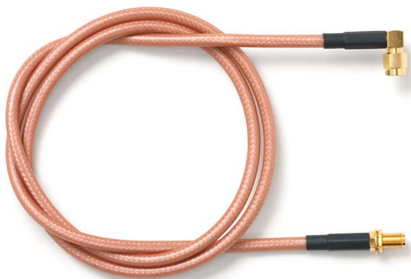
Model 73071-X SMA Right-Angle Plug to SMA Bulkhead Jack, RG142B/U

SMA Right-Angle Plug to SMA Bulkhead Jack, RG142B/U, RG316/U