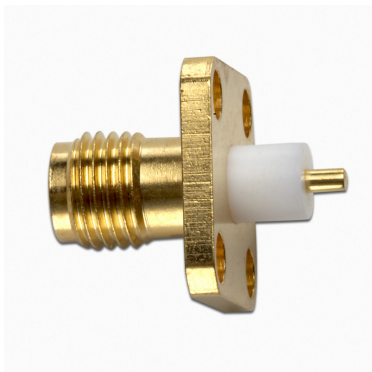
Model 72962 SMA JACK PANEL RECEPTACLE (4 HOLE)

High bandwidth, small size, and durability for confident connections