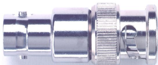
Model 5090 BNC (F) to 2 Lug Triaxial (M) Adapter