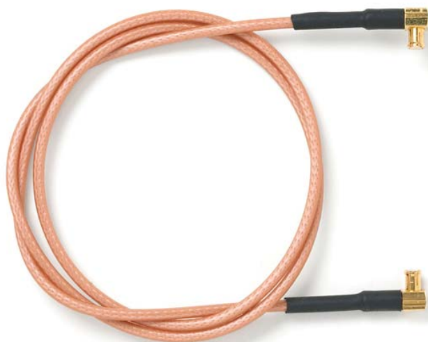
Model 73068 MCX Right-Angle Plug to MCX Right-Angle Plug, RG316/U

Snap-on coupling and miniature size for fast connect and disconnect where space is limited