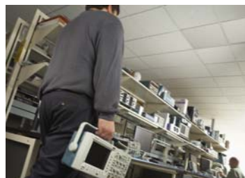
Lightweight design for easy transport from lab-to-lab.