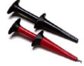
AC280-FL: Hook Clips.