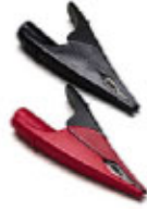
AC285-FL: Alligator Clips.