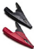
AC285-FL: Alligator Clips.