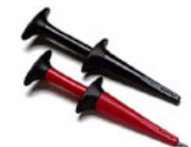
AC280-FL: Hook Clips.