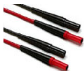
196-3523-00: Extender Leads (1.5 m).